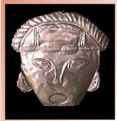
"Goddess of Silver"